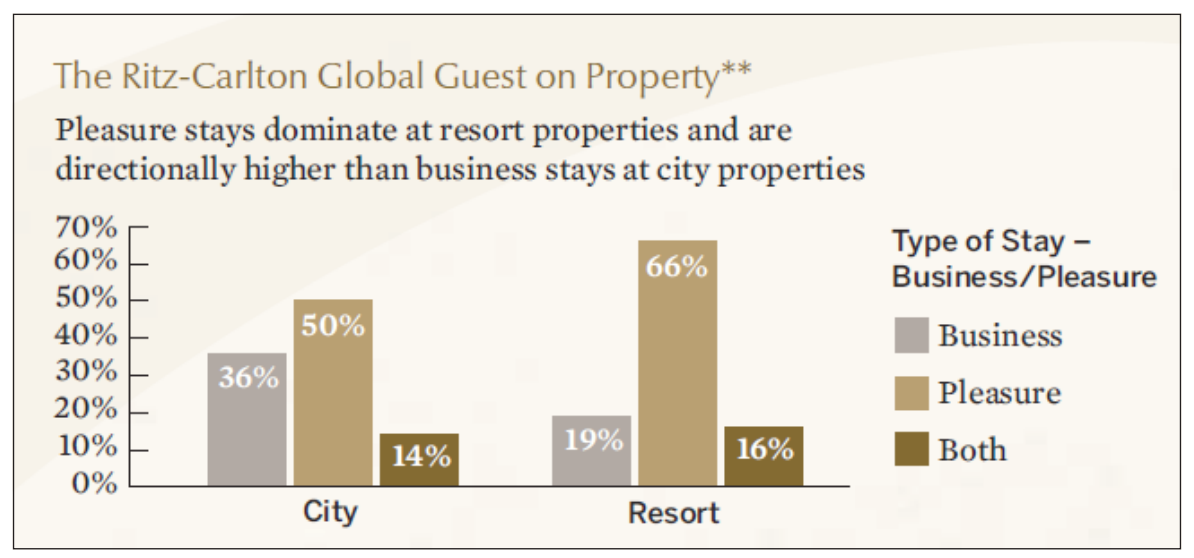
Figure 3 The Ritz-Carlton's global guest by property

*** 2008 Full Year Brand Tracking Summary, Burke, Inc. Users have stayed at The Ritz-Carlton within past 12 months