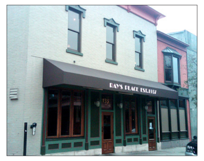
Ray's Place Kent Currently